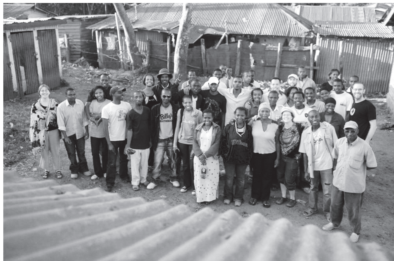
Members of the Independent Media Center Convergence worked with the Proactive Youth Group in Kangemi.